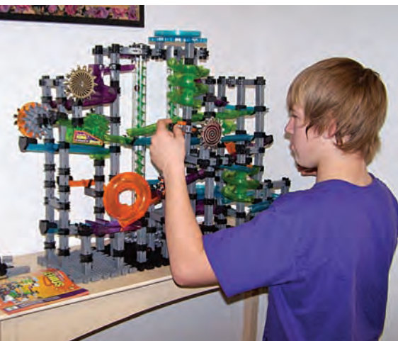
A young man at Children's Village in Coeur d'Alene, Idaho, works on his science-gravity project, which was part of an educational donation by the DLCF. Though he arrived fearful and withdrawn, having suffered abuse at home and at school, within two months he had built this model and was demonstrating it to the class. He is one of many children who have been encouraged, loved, taught, and cared for at Children's Village and have benefited from Foundation contributions.