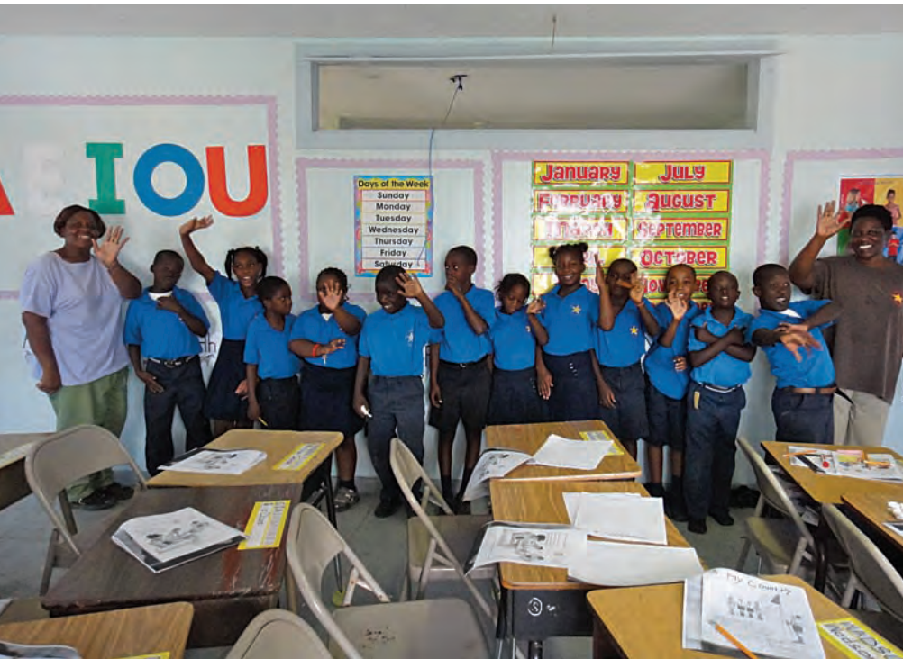
The cheerful and loving kids of Every Child Counts in Marsh Harbour, Bahamas, pose for a portrait. Here, children with special mental and physical needs receive close attention, education, and life skills from nurturing instructors and caregivers. DLCF donates scholarship funds and program support.